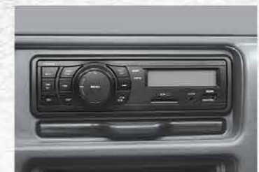
Tuner Radio with USB Port Entertain yourself during long drives with a dedicated tuner radio along with a handy USB port.