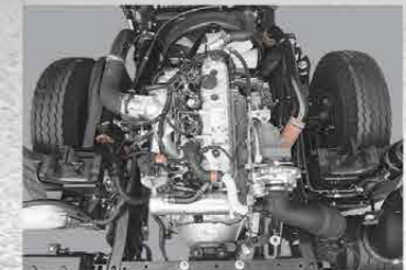
Blue Power Diesel Engine Small yet powerful - the compact cab carries a robust 4JH1-TC Euro IV Compliant Blue Power engine that overhauls a maximum power output of 106 PS and 230 N-m of torque.