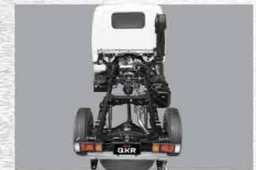
Reinforced Chassis Frame Easily carry load to drive your business forward with its Reinforced Chassis Frame with a Gross Vehicle Weight of 4 tons.